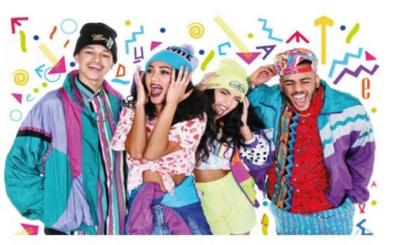
$15 t-shirts on sale beginning Thursday 11/15