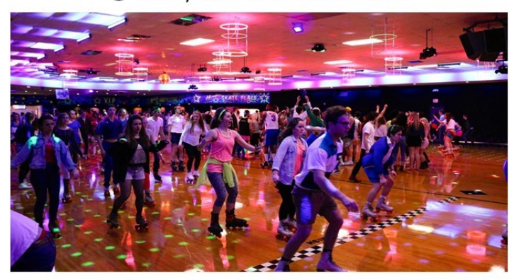
Tickets on sale at lunch: Monday 11/12 through Friday 11/16 $10 in advance / $20 at the door

7:00-9:00 PM on Wednesday, November 28 @ Dairy Ashford Roller Rink